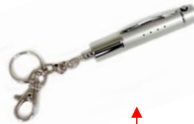
Key Chain Attachment (Included)

Spy Chest Inc. 6589 Bill Lundy Road Laurel Hill, FL. 32567 TEL: 850-683-8787 FAX: 850- 682-0083